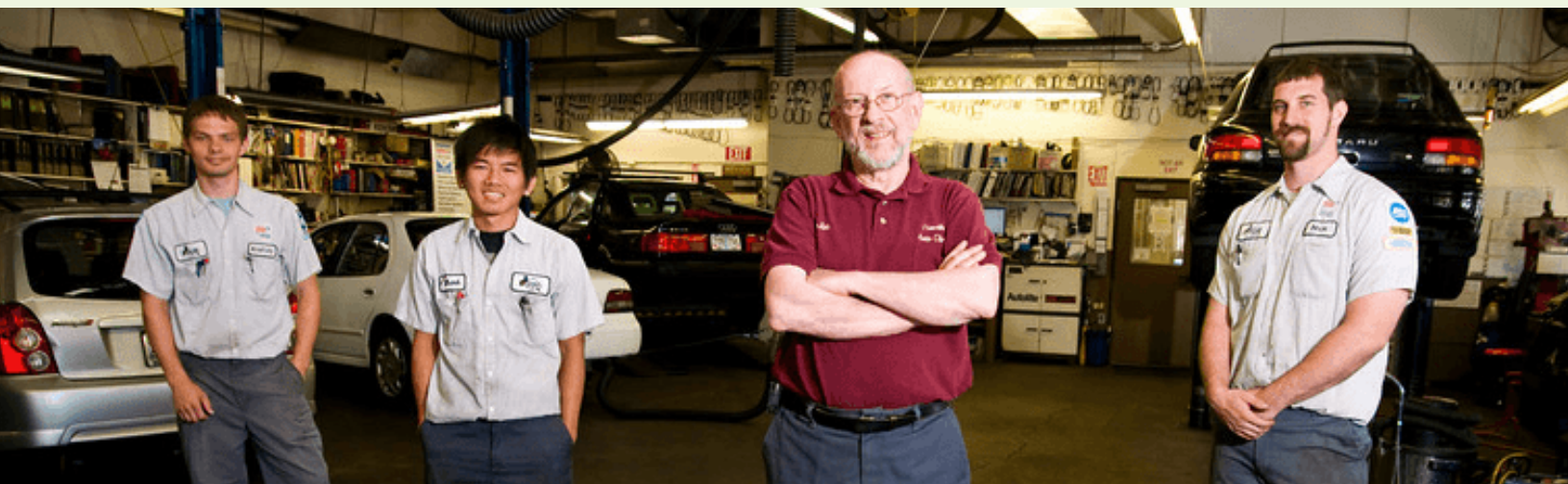
Hawthorne Auto Clinic is a full-service auto clinic that has been in business for 35 years and employs 11 people.

The overwhelming majority of the tax law goes to millionaires. That money isn't going to get spent in my shop, it's going to get invested on Wall Street. My customers and my community need real public investment. We need to stop having to choose between paying the rent, going to the doctor or getting that new set of tires.